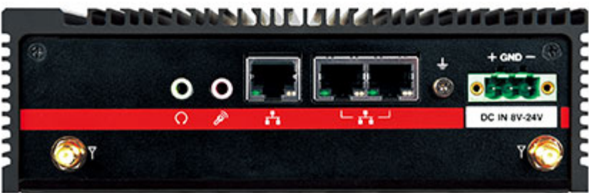
Support: 🔼 Specifications | 🔀 Expansion modules | 🔼 Dimensions

MiTAC's MB1-10AP Embedded Box PC is the next generation box pc with Intel® Apollo Lake processor. The whole new SOC structure packs more powerful capability for your tasks or applications.